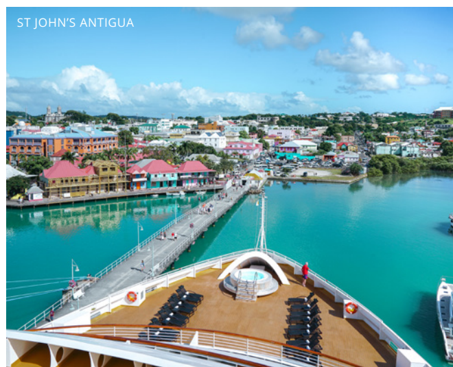
ST JOHN'S ANTIGUA