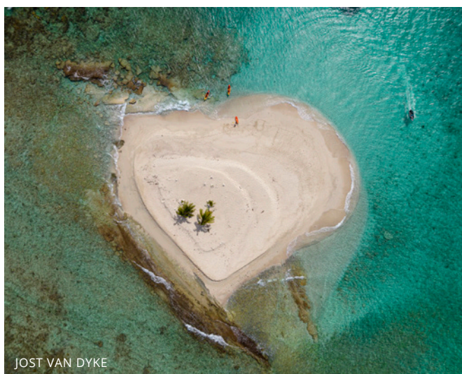
JOST VAN DYKE