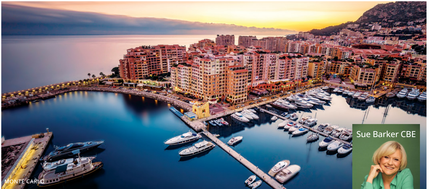
Sue Barker CBE