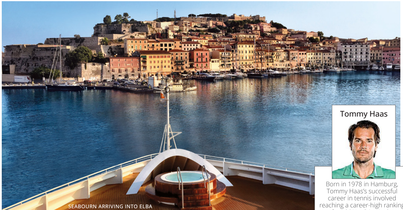
SEABOURN ARRIVING INTO ELBA