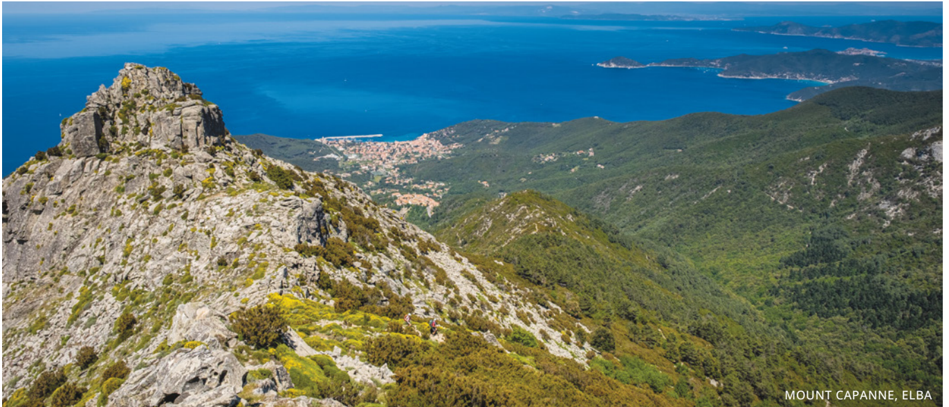
MOUNT CAPANNE, ELBA