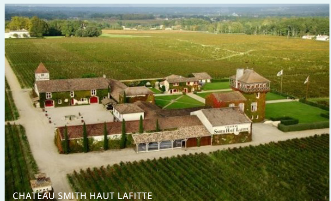
CHATEAU SMITH HAUT LAFITTE