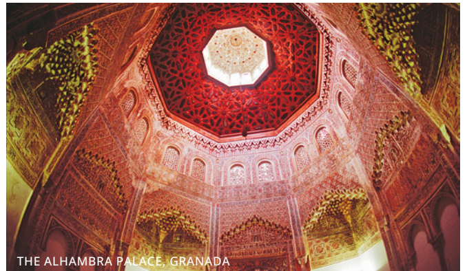
THE ALHAMBRA PALACE, GRANADA

Enjoy a guided tour through the old city with its narrow-cobbled streets, boutiques and Gothic churches then stroll to a tapas restaurant to enjoy a taste of typical and delicious Menorcan fare.