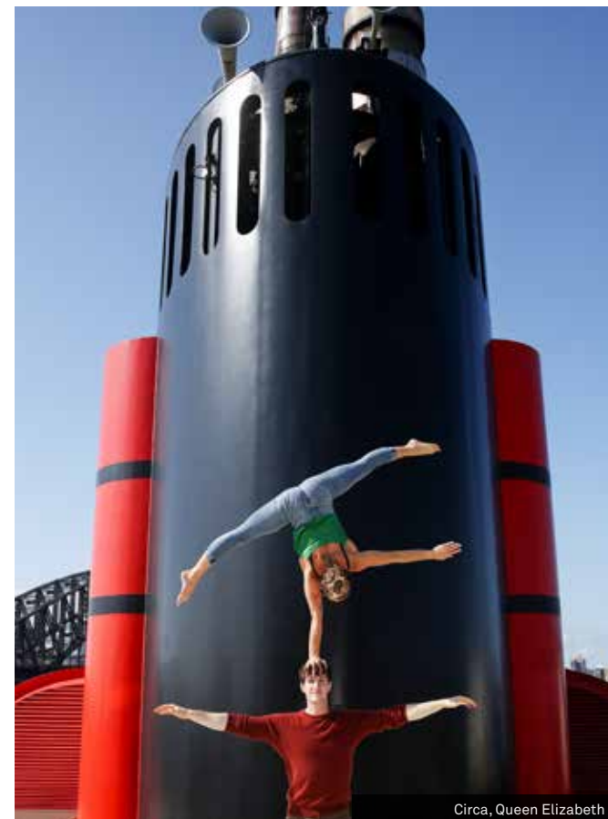
Circa, Queen Elizabeth

Actors from the Royal Shakespeare Company spend seasons on board Queen Mary 2 enchanting guests with their stage productions and behind-the-scenes knowledge. Workshops are a delight; you may realise a talent for playwriting. And in the evenings, meet the actors for Shakespeare Tales , their intimate and informal performances of their favourite pieces.