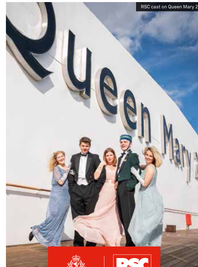
RSC cast on Queen Mary 2