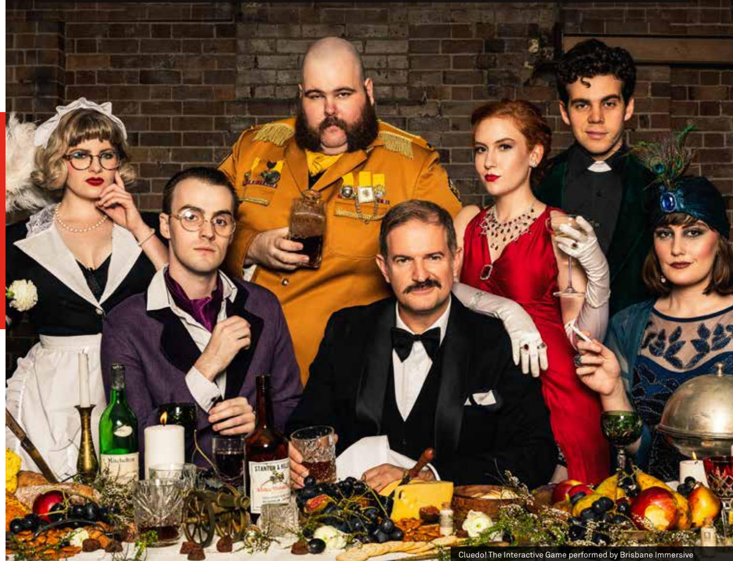
Cluedo! The Interactive Game performed by Brisbane Immersive

This is a must for theatre lovers, an ever-growing calendar of productions that is setting the bar for entertainment at sea. Picture jaw-dropping towering acrobats, or The Best Exotic Marigold Hotel , even an immersive murder mystery dining experience. This is a new era for Cunard theatre and its future is exciting.